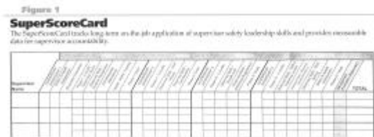
Figure 1 SuperScoreCard

Ultimate accountability for safety performance should extend to the supervisor's annual review. The team approach gives a supervisor more control over the work group's performance, and auditable systems provide data to support accountability.